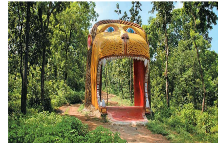
Barnawapara Wildlife Sanctuary