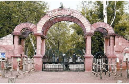
Kanan Pendari Zoo