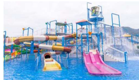
Bubble Island Waterpark