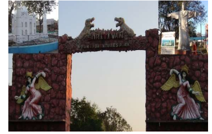
Smriti Adventure Park