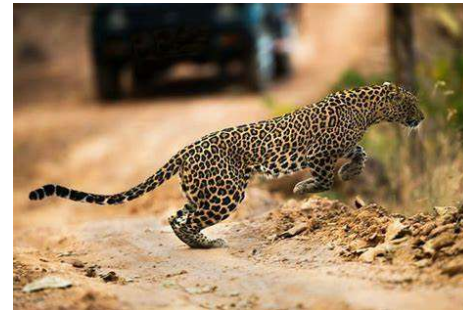
Achanakmar Wildlife Sanctuary