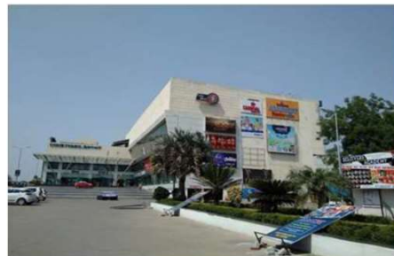
City Mall 36