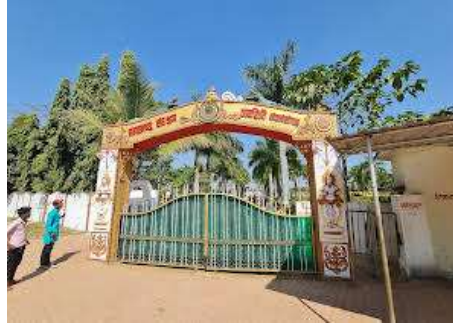
Crocodile Park, Masturi