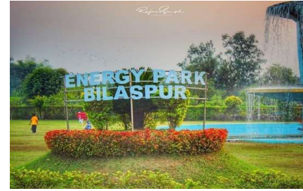
Solar Energy Park