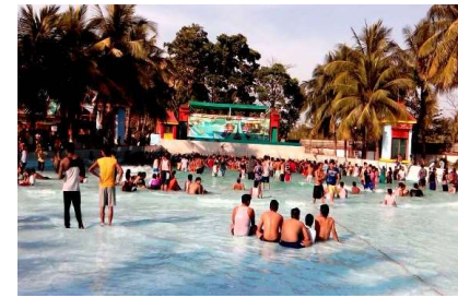
Water Bomb Waterpark