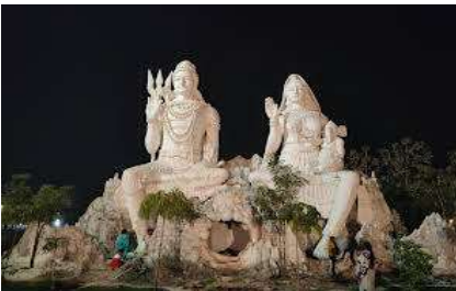
Hemunagar Baal Udayan